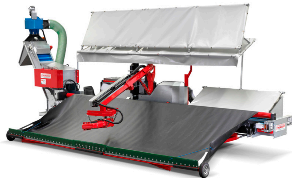
Fully automatic tree shaker