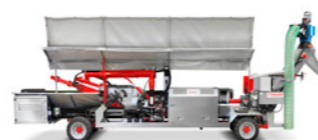
Counter canvas wagon