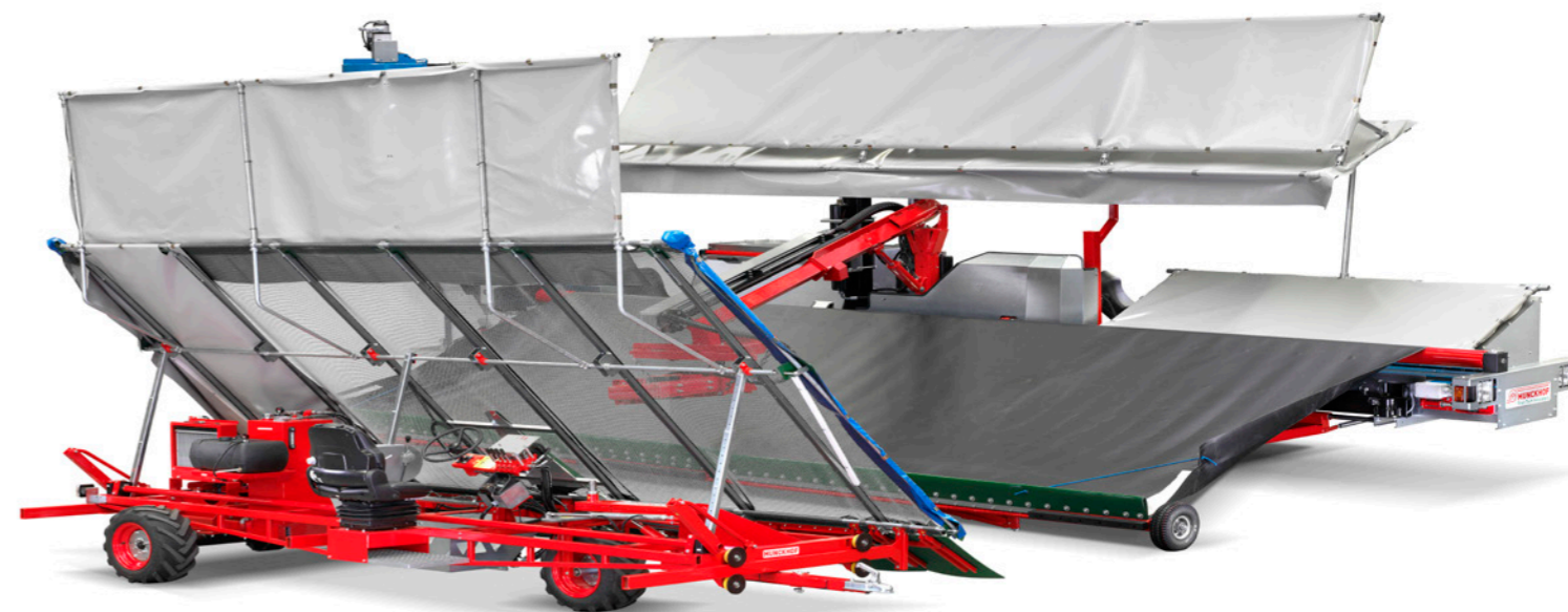
Combination fully automatic and counter canvas wagon

On both tree shakers, the bin trailer with turntable takes care of a quick change of full and empty bins.