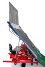
Counter canvas wagon